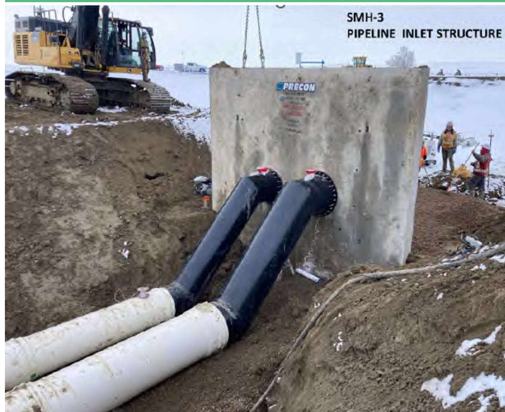
SMH-3 PIPELINE INLET STRUCTURE. Precast inlet (Supplied by Precon).