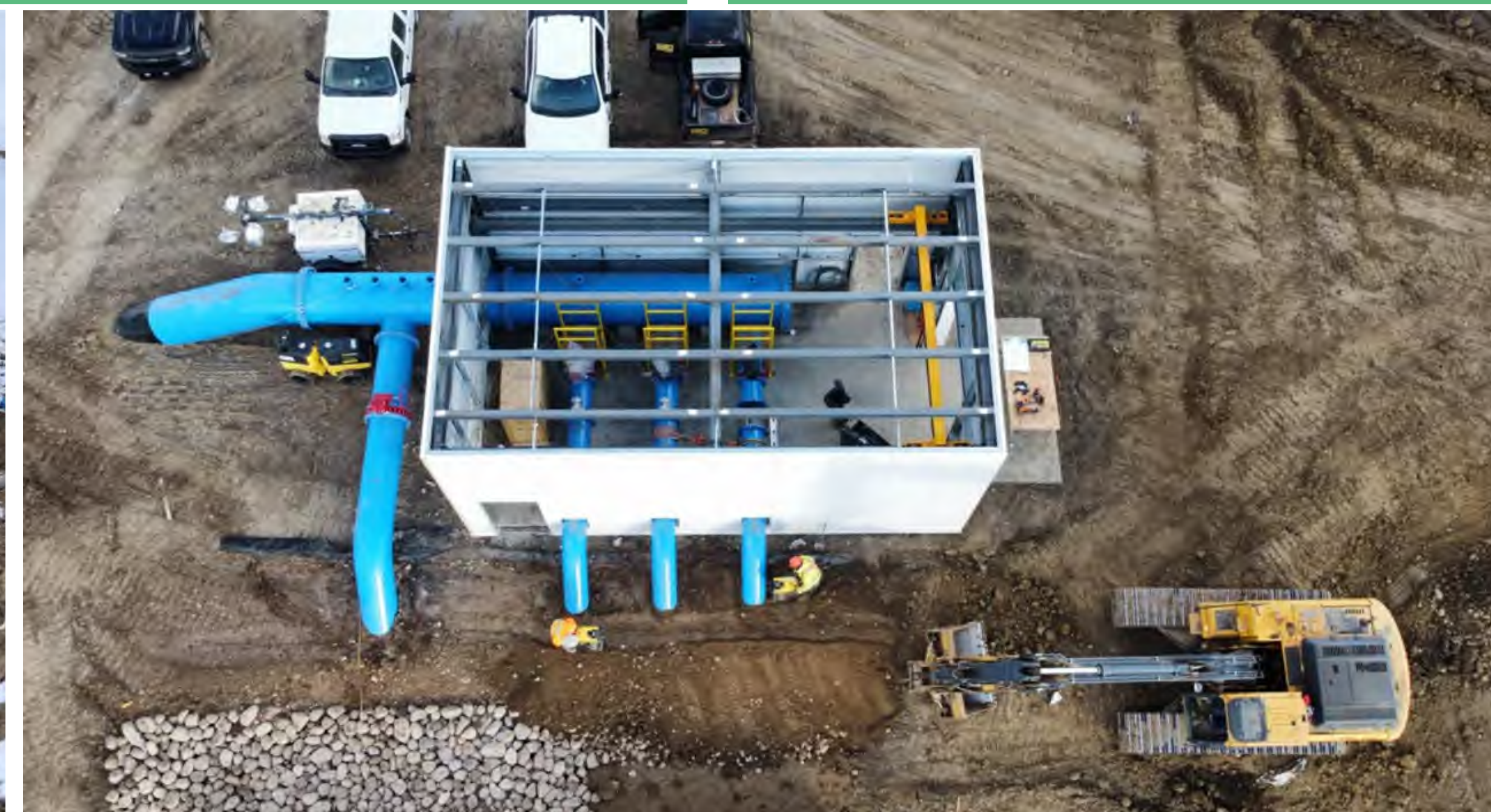
West Medicine Hat 2 Balancing Pond and valve house. Constructed by Bullins Construction. Winter 2023/2024