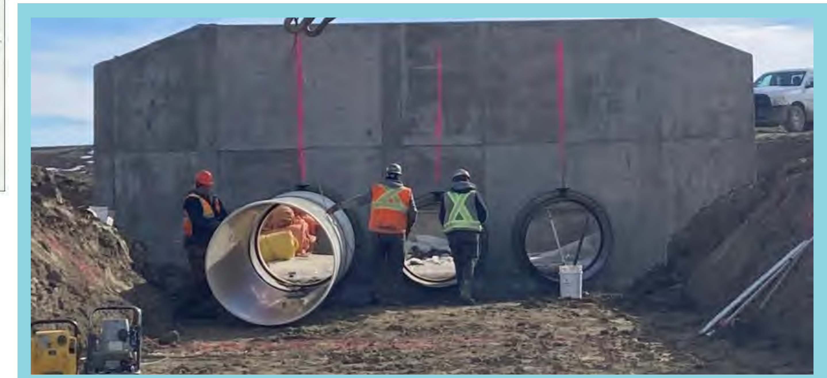
Bow Island 10 Pipeline Inlet Structure. Winter 2022/2023