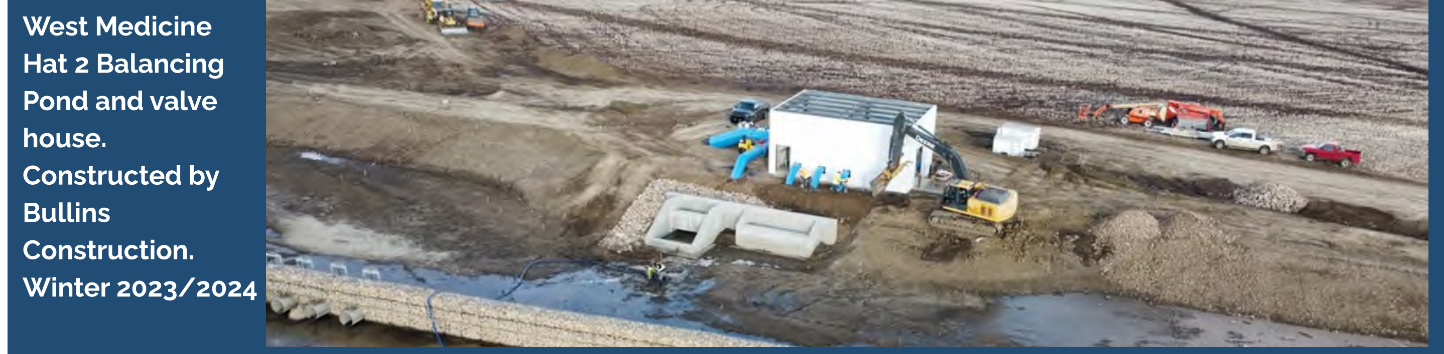
West Medicine Hat 2 Balancing Pond and valve house. Constructed by Bullins Construction. Winter 2023/2024